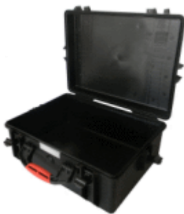
Cable plastic case – large size