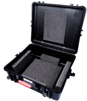
Plastic transport case