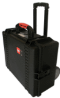
Cable plastic case with wheels – large size