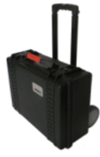
Cable plastic case with wheels – medium size