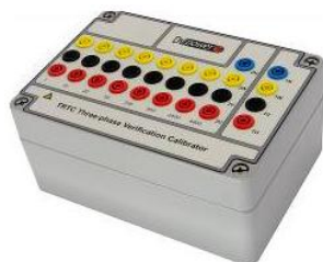
TRTC Verification Calibrator