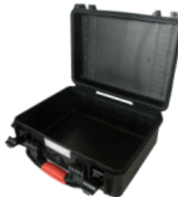
Cable plastic case – medium size