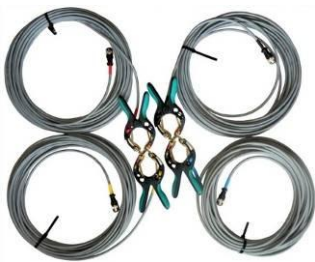
H winding test cable set

All specifications herein are valid at ambient temperature of + 25 °C and recommended accessories. Specifications are subject to change without notice.