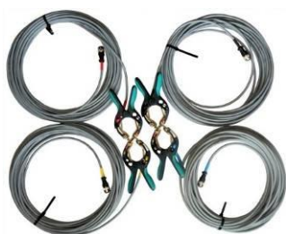
H winding test cable set

All specifications herein are valid at ambient temperature of + 25 °C and recommended accessories. Specifications are subject to change without notice.