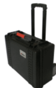
Cable plastic case with wheels – medium size