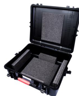
Plastic transport case